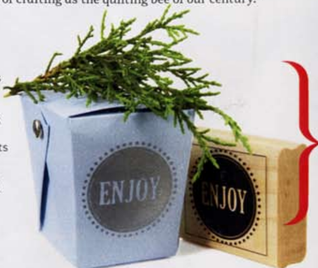
SEE SHOPPING GUIDE FOR DETAILS